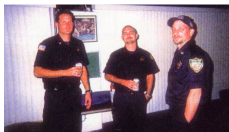
Three Narconon San Diego staff on the Sunshine Summit Volunteer Fire Dept.