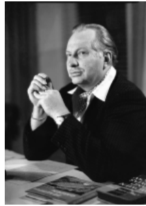
Author and humanitarian, L. Ron Hubbard