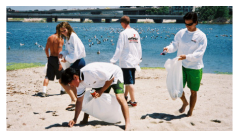
Narconon Newport Beach staff, interns, and students cleaning Doheny State Beach.