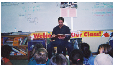
A Narconon intern participating in "Read Across America."

It has always been our philosophy that Narconon staff, students and graduates should be active, contributing members of their community. Narconon staff and students are encouraged to participate in community outreach activities, whenever they are invited in, such as volunteer firefighting, environmental cleanups, work assistance with seniors, drug education, school & student assistance, and much more.